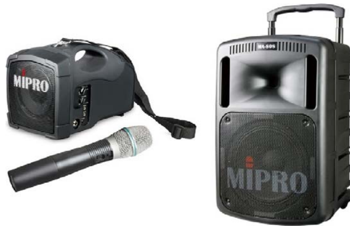
Portable PA systems, for 200 people and for 2000 people